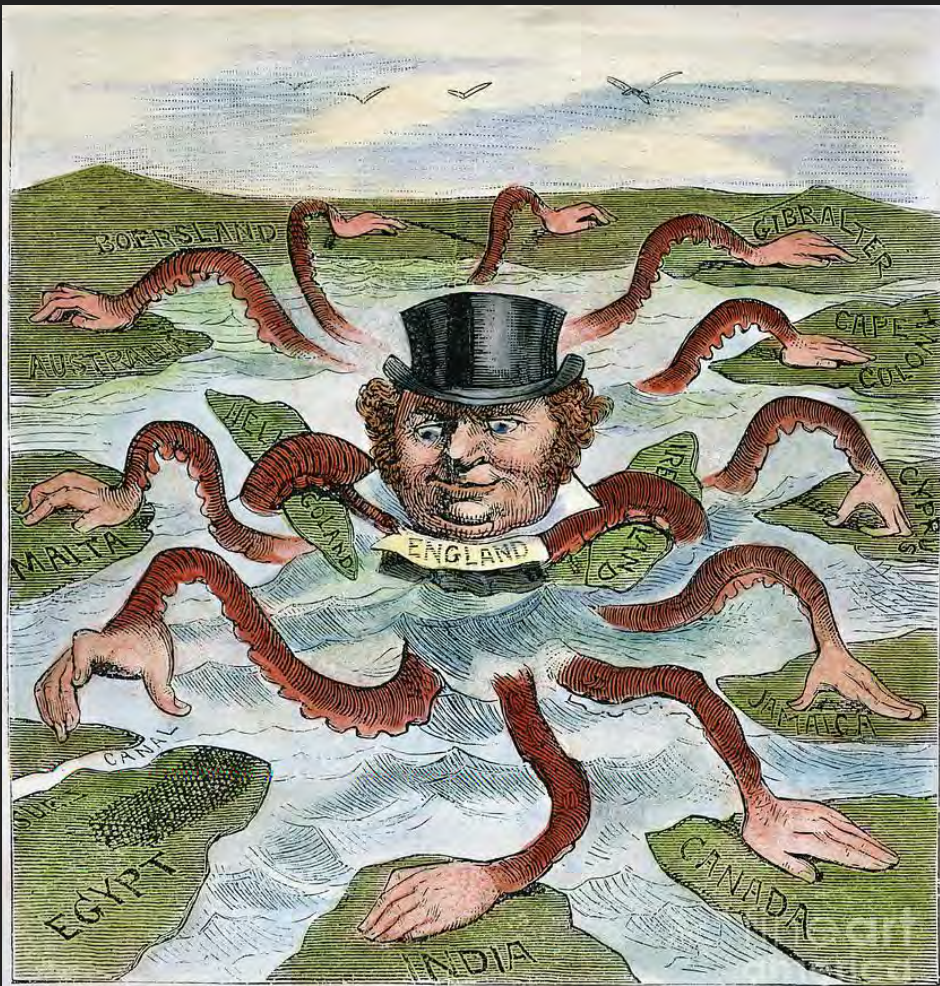
THE DEVILFISH IN EGYPTIAN WATERS.