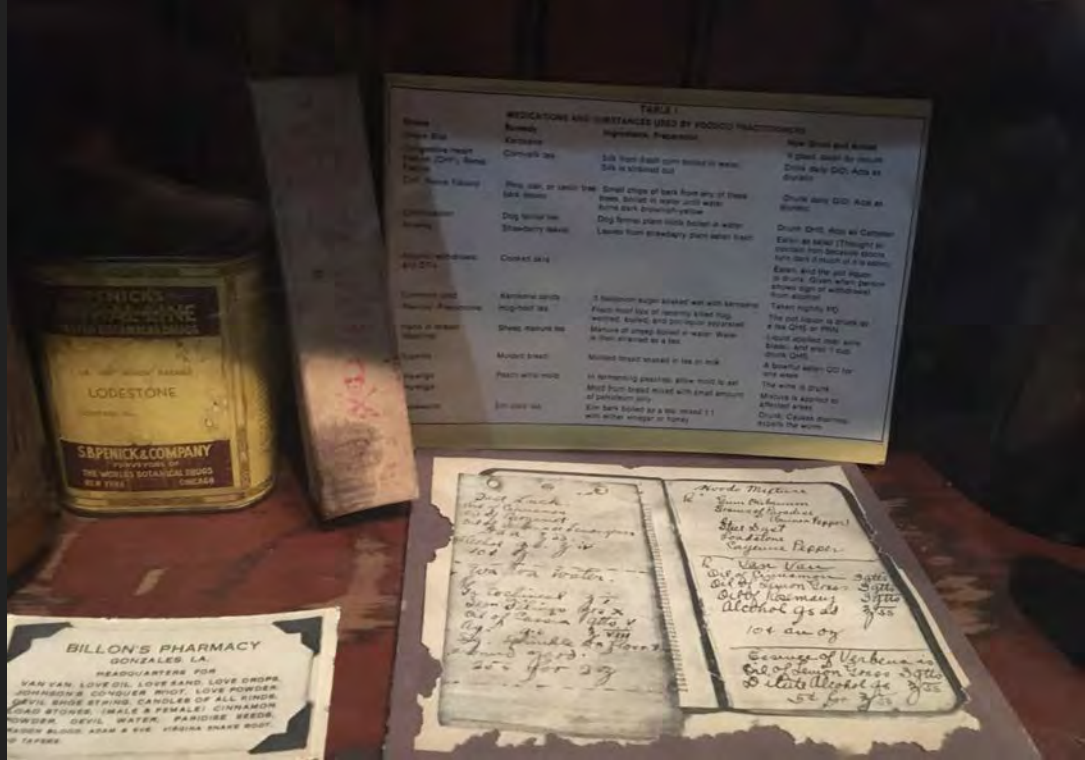
“New Orleans Pharmacy Museum” (Established in 1823) Voodoo Pharmacies of New Orleans & Medications and Substances Used by Voodoo Practitioners